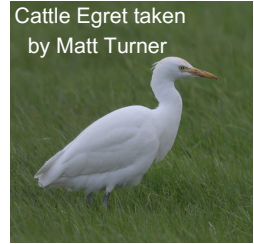
Cattle Egret

Now, another egret is beginning to put in regular appearances - the Cattle Egret. Having first bred in 2008 down in Somerset, this winter, there have been up to eight in the fields below Shotley Church, but at the beginning of the month one was seen with the cattle (very apt) down towards Stutton Mill. They are slightly more squat in appearance than Little Egrets with a sulky demeanour - if you'll forgive the anthropomorphism. Their bill is yellow, not black and in summer plumage, their crown and back develop beautiful biscuit-brown tones. In summary, if you see a white heron-like bird with some cows - this is your likely candidate. Mark Nowers