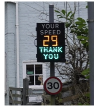
What SID saw!